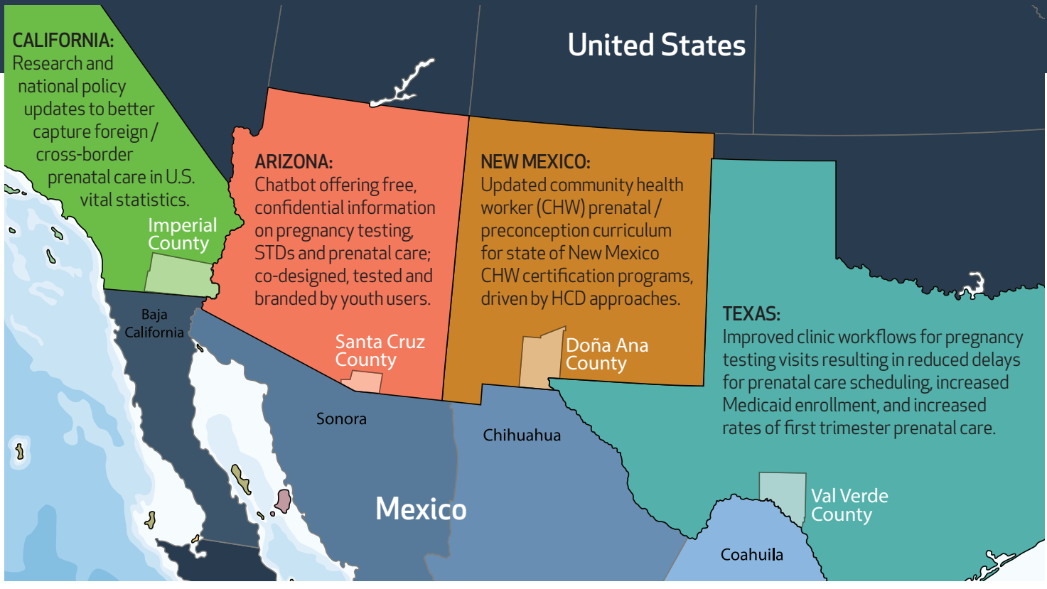
Figure 1. Selected Target Counties and State Team Innovation Solutions (Prototypes)