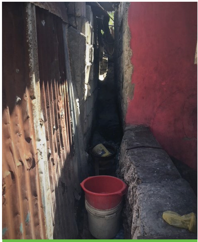
Comparison sites not reconfigured as part of humanitarian assistance had significant challenges related to access and egress

The comparison sites had installed little or no risk mitigation infrastructure, such as retaining walls or formal drainage systems. Rubble that continued to pose a risk to residents had yet to be cleared, including perched on hillsides above community areas, posing significant risk to residents in the event of landslides. Several communities were at risk of flooding and the spread of disease due to unsanitary conditions.