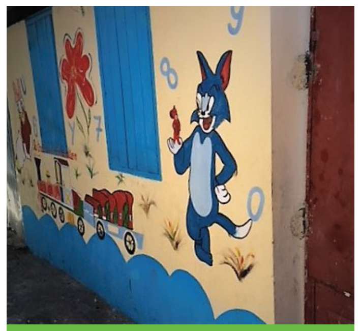
The New School Built in the Community from Shelter Materials Provided by the Project

Overall Perception of Disaster Risk: Perhaps the clearest consensus on the part of the community with regard to the benefits of the project was that it made the community safer. There is a universal perception on the part of the community that the project was able to decrease vulnerability to natural hazards, particularly earthquakes. Among the examples why community members felt that they were less vulnerable were: