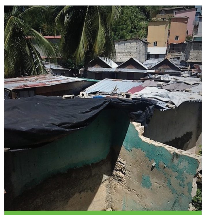
A comparison community. KATYE can be seen across the ravine in the background

The findings from engineering assessments and community meetings in the comparison neighborhoods stood in sharp contrast to those in Ravine Pintade. Areas observed by the study that did not receive coordinated neighborhood-based and community-driven neighborhood reconfiguration and planning as part of humanitarian assistance have largely not managed to recover. Moreover, in some respects, the way humanitarian assistance was provided created long-term challenges for the community, particularly as related to housing, water and sanitation, protection, health and access.