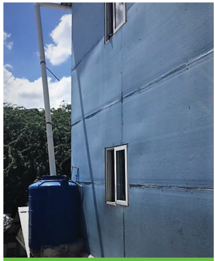
Rainwater Harvesting In Use (2018)

However, study engineers and community members identified several areas of the neighborhood in which the drainage infrastructure has been inadequately maintained and is functioning inadequately. In part, the lapse in maintenance may be due to a decline in the effectiveness of water committees established in each zone of the neighborhood, which were responsible for reinforcing community maintenance of infrastructure. As part of the project, these committees purchased water for resale within the community, a strategy that in its outset saved money for the community (since buying bottled water was exceedingly expensive), and generated savings for the committee that could be utilized for maintaining water and sanitation systems. While the profits from the sale of water were being used to sustainably provide the community access to clean and low-cost water, the study team was unable to find evidence that profits were also being reinvested in sanitation.