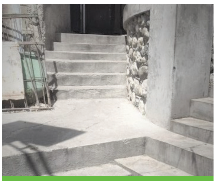
Public walkways, stairs and mitigation infrastructure constructed by the project (photographed in 2018)

Concrete stairways are intact and safe; walkways are clear and passable and largely free of obstructions; and in nearly all neighborhood areas, the public walkways have not been encroached upon for construction of private space or other private purposes. All handrails are intact and well maintained. Retaining walls are in good condition, without signs of damage that could undermine their structural integrity. Public infrastructure intended to promote neighborhood resident engagement and interaction, such as seats and tables, remain intact and usable, available for the public, and have not been re-purposed or privatized. In some cases, they are showing signs of wear and tear due to heavy use. While the solar public lighting installed in coordination with UN agencies and the Government of Haiti were frequently cited as positive contribu-