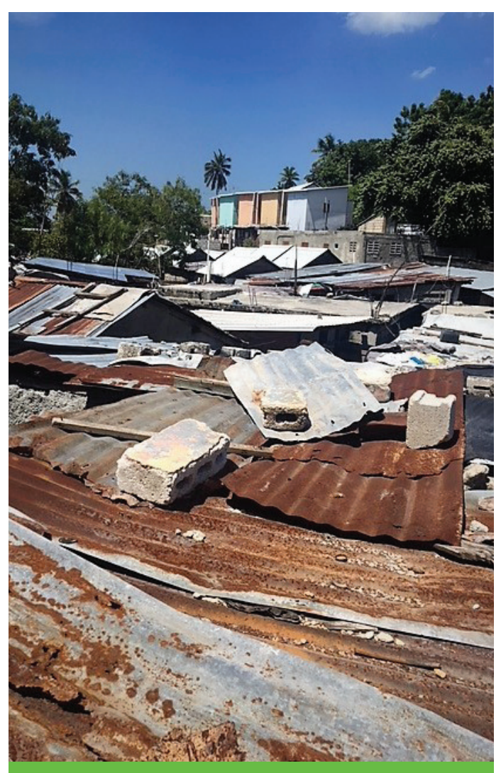
A view of the KATYE project from across the ravine, where people live in continued high levels of risk (photo 2018)

Participating government officials also stated that there was a perception of NGOs as struggling to extend opportunities to communities for substantive participation and a sense of ownership, and instead they created an environment characterized by a dependency on—and competition for—resources given by NGOs. This was likely exacerbated by a lack of coordination and collaboration of NGOs at the neighborhood level and the absence of shared community engagement mechanisms.