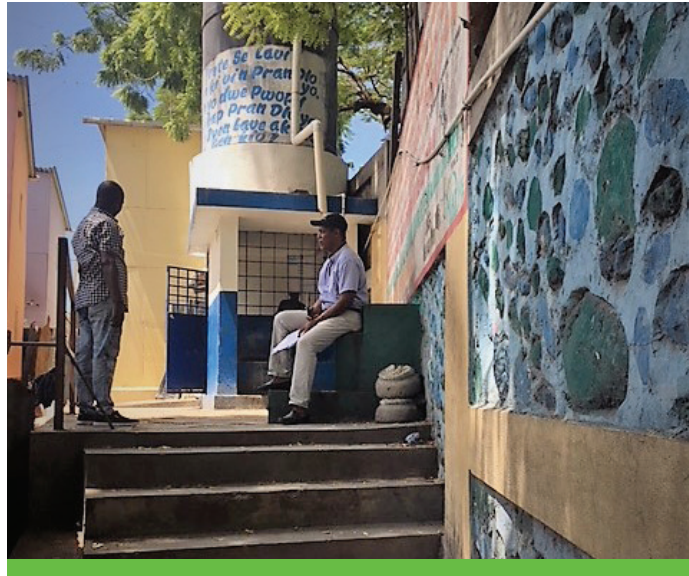
Water system and walkway