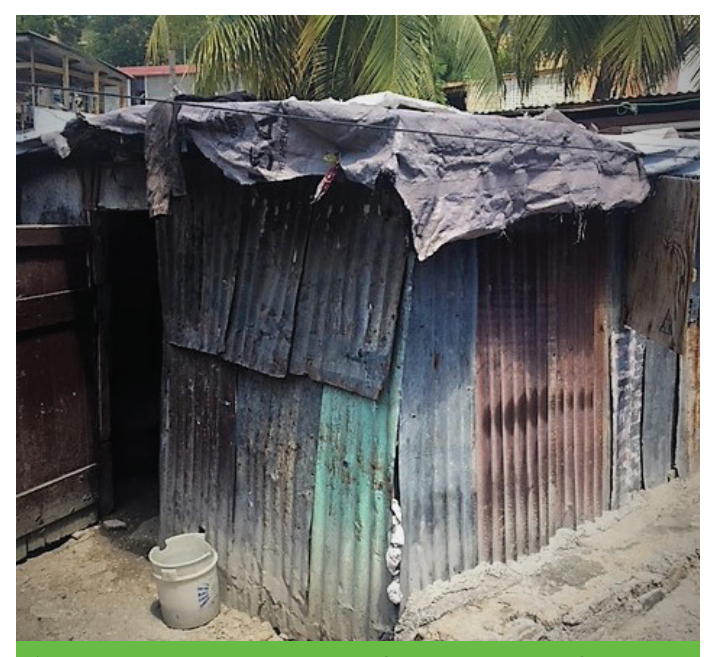
A shelter in a comparison site built with found materials and left-over emergency supplies

PCI studied other communities to assess the degree to which neighborhoods that received more traditional forms of humanitarian assistance had fared over time relative to Ravine Pintade, including areas immediately adjacent to the Ravine Pintade, in Nazon, and Fort National. This included whether they were able to repair and provide shelter, reconfigure the settlement to allow for drainage, improved access and egress, formalize water and sanitation systems, and included the perspective of the community on their recovery. The criteria for inclusion as a comparison community was to have received assistance from humanitarian assistance agencies working across the sectors; like Ravine Pintade, but had not received significant subsequent development or housing programming after the initial phase of humanitarian assistance; and were in areas that were similar to Ravine Pintade in terms of the challenges posed by geography, density, and socio-economic status. PCI also considered recommendations for where to focus the study from the Government of Haiti. Neighborhoods selected were considered representative of other neighborhoods that did not receive assistance similar to that provided in Ravine Pintade.