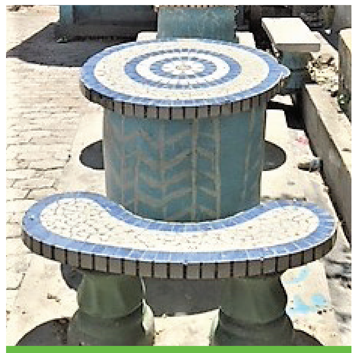
Tables constructed by Katye for community activities

Contrary to commonly held assumptions at the time, rebuilding improved neighborhood and housing infrastructure with better standards did not result in forced evictions or displacement due to a shortage of space. The neighborhood is now home to an estimated 25% more people, and most residents in Ravine Pintade were there before the earthquake.